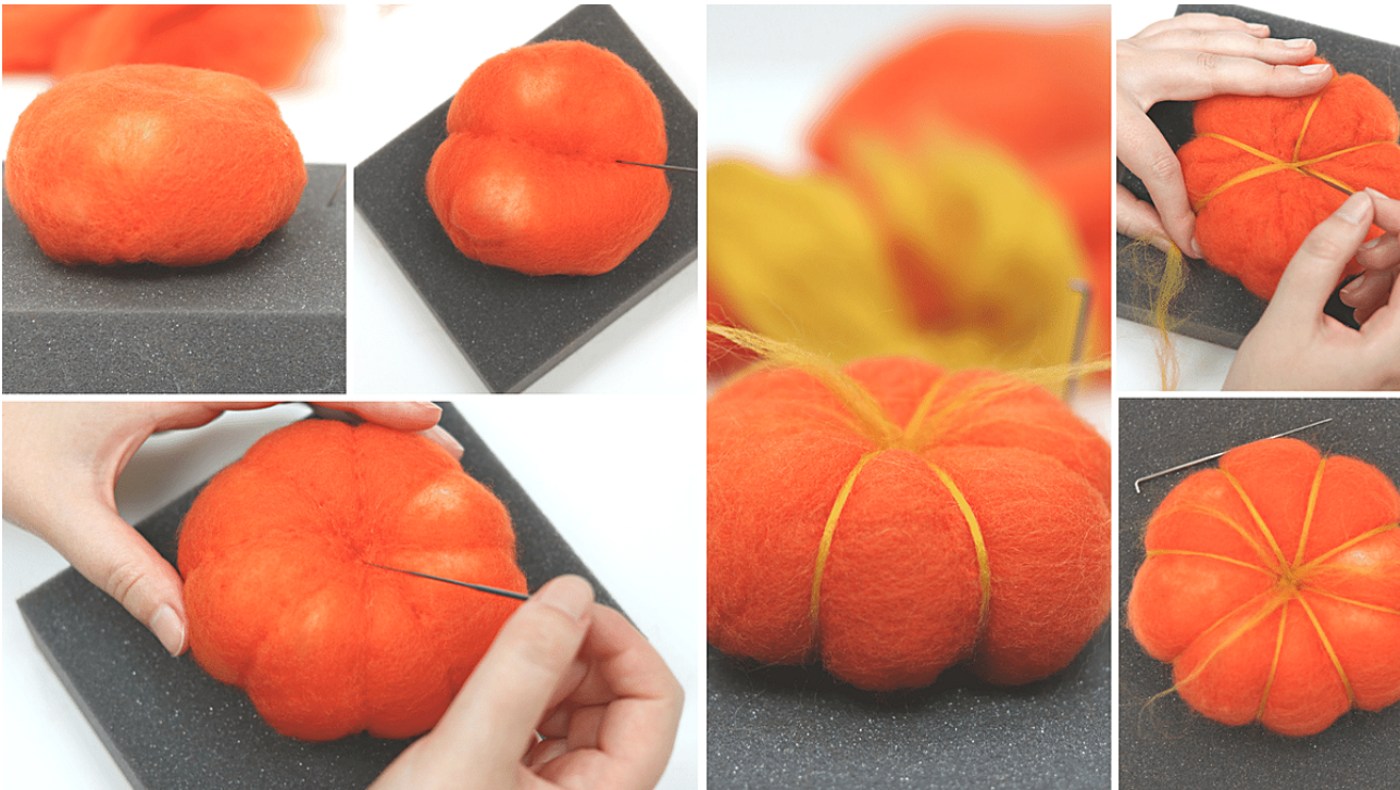
Pretty pastel pumpkin wreath and five minute macarons, both made using soft core wool and a top layer of carded wool.