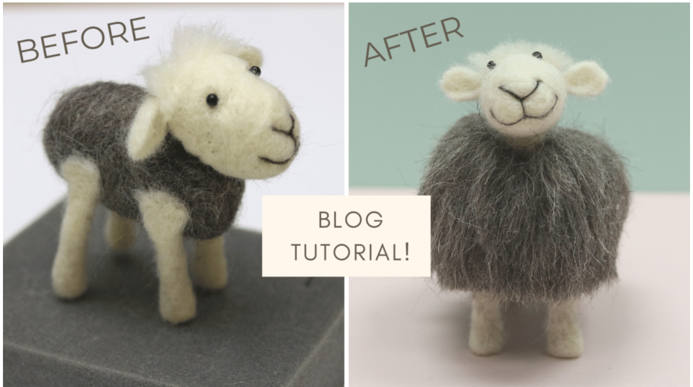
Long coat created using Herdwick wool

Anything that works, but especially wool tops, including Merino. My Herdwick sheep below have a long coat of Herdwick and the before and after results show how it is transformed. For all animals Merino and Corriedale are also really great choices. I spray mine with hairspray to keep everything in place. Some say it can discolour white wool, over time, but I have never found it to be an issue. CLICK FOR TUTORIAL How To Create Long Animal Fur?