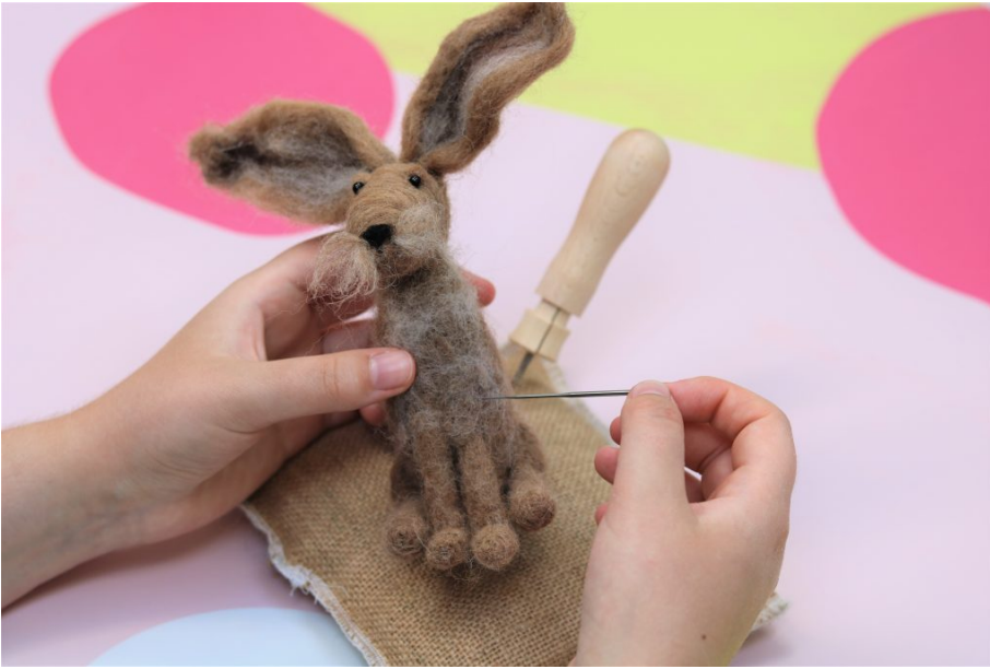
Brown woodland hare created using Shetland Moorit wool top; no core. White Jacob top and carded batt used for surface details and whiskers.