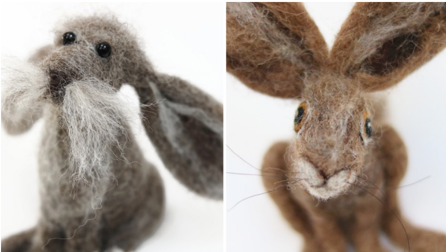
Hares made from Grey Jacob top and Shetland Moorit top

A coarse wool top (often called roving) is a joy to work with, felts up quickly and easily and is really cost effective. I use it for almost all of my needle felted animals and in many of my needle felting kits. I love using it for these projects as I can get a very tight, firm shape in super quick time, and with few, if any, needle marks. I have been using coarse British wool tops since 2013 and love them as much now as I did then. You can find my handy guide to wool tops at the bottom of the page.