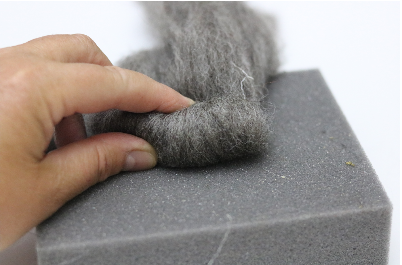
Sheep body using just grey Jacob wool top; no core.