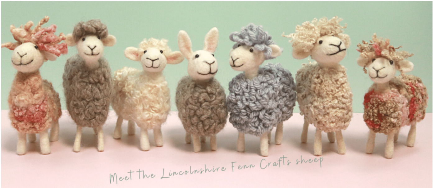
Meet the Lincolnshire Fenn Crafts sheep