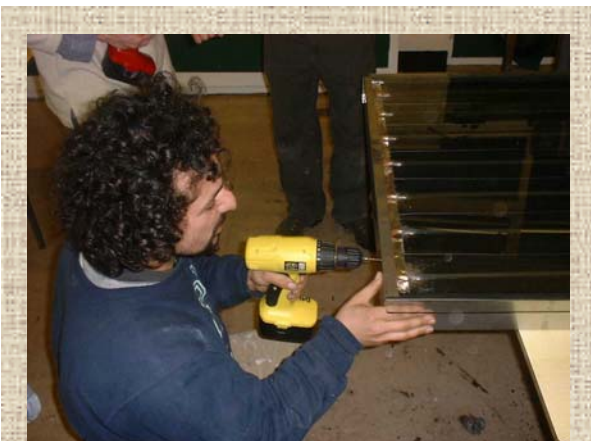
course participants assembling their own panels.

The first thing to do is to choose either evacuated tubes or flat-plate collectors. Installed prices for both are typically in the range £2500 to £5000. If you choose flat-plate, make sure that the collectors have a selective surface – a special coating that maximizes the absorption of solar radiation