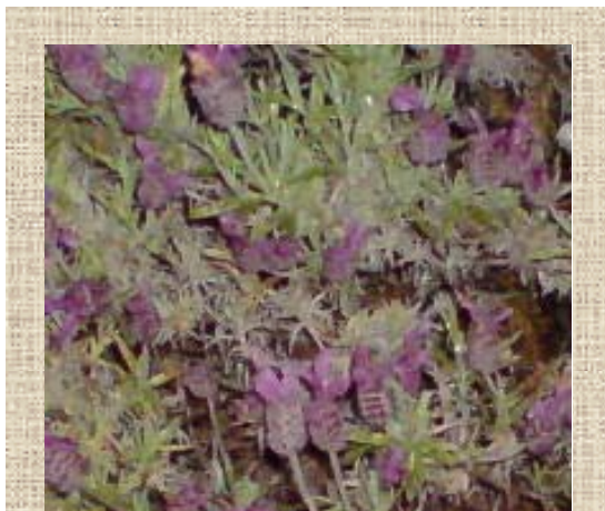
lavender in flower. Flowers are distilled to produce lavender oil - a relaxant; the distillate water is good for burns.

A word about aromatherapy. It's not all about 'curing people with smells', and many of the more 'spiritual' claims for the therapeutic properties of plant essences are unproven. However, the fact that some plants have antiseptic or healing properties doesn't require a leap of faith.